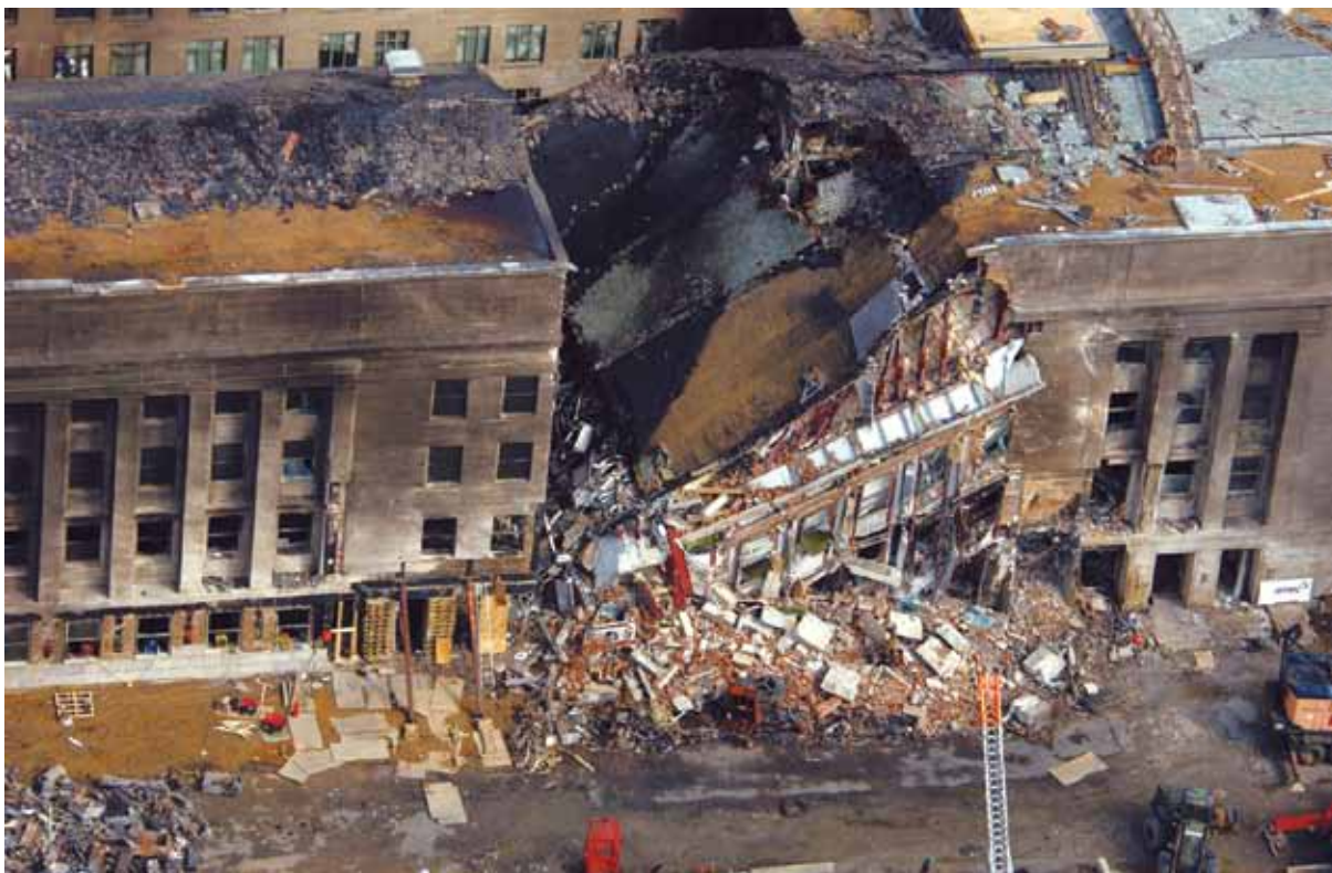
A devastating look at the western side of the Pentagon after terrorists crashed a 757 jet into it at 9:37 a.m. EDT, on Sept. 11, 2001. Including the hijackers, there were 64 people aboard the airplane.