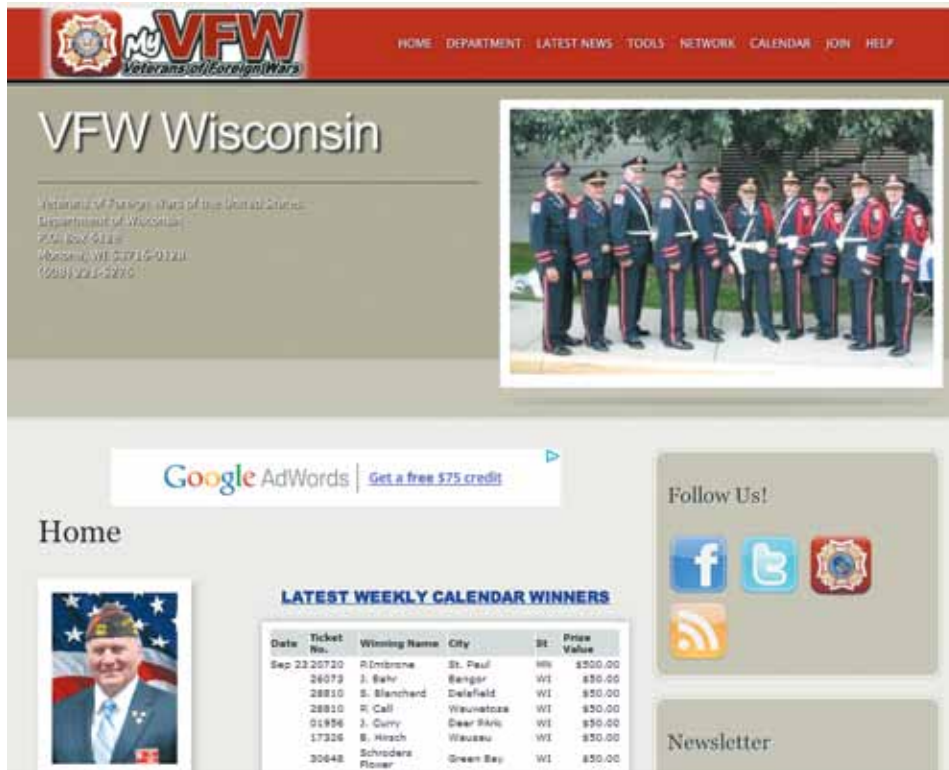
VFW's Department of Wisconsin won first place in the 2011 Website Contest. Visit the site at www.vfwofwi.com .

The deadline for next year's contest will be April 27, 2012. See the "Extra! Extra!" section of the January/February issue of Checkpoint for more information about the 2012 competition.