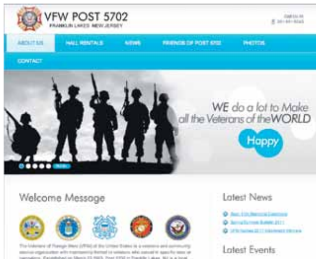
Post 5702 in Franklin Lakes, N.J., won first place in Post/District category of the 2011 Website Contest.