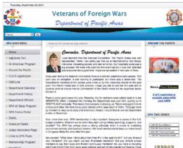
VFW's Department of Pacific Areas won second place in Department category for the 2011 Website Contest.