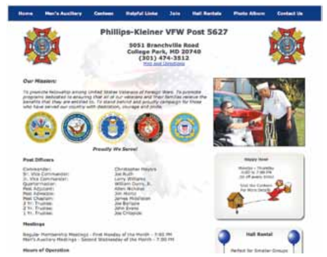
Post 5627 in College Park, Md., won second place in Post/District category of the 2011 Website Contest.