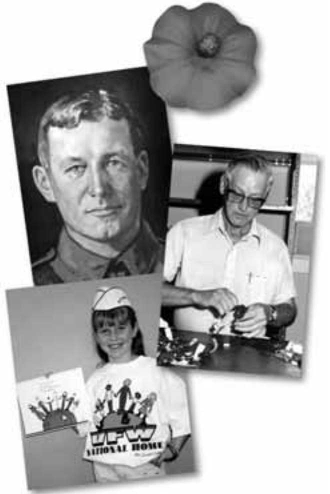
Top: Canadian Col. John McCrae, author of "In Flanders Fields." Right: A disabled veteran assembling Buddy Poppies. Bottom: A National Home Buddy Poppy child.

As your Post's Buddy Poppy Chairman, you need to build enthusiasm for this program. Reiterate to your fellow members the two-fold importance of Poppies. It's truly all about veterans helping veterans and living up to VFW's motto of "Honor the Dead by Helping the Living."