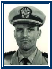
CDR DANFORTH E. WHITE United States Navy June 17, 1930 – March 31, 1969 Panel 28 W, Line 101

Since the site was launched on November 10, 1998, more than 100,000 text, image and audio remembrances have been left, creating a permanent archive of memories and tributes to those whose names are inscribed on the Memorial.