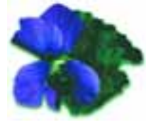
Blue Flower: Love of Country