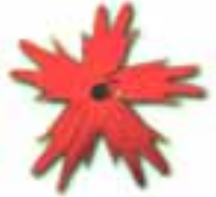
Red Flower: Courage and Gallantry