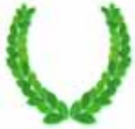
Laurel Wreath: Victory Over Death