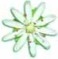
White Flower: Devotion to Duty